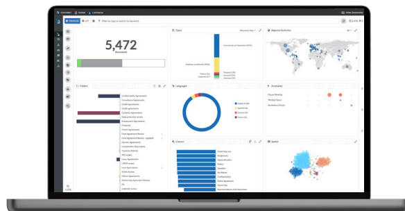
Understand the entire dataset at a glance with Luminance's AI-powered data visualisation

19/20 KEY FIELDS RECOGNISED AFTER JUST 20 HOURS OF USE