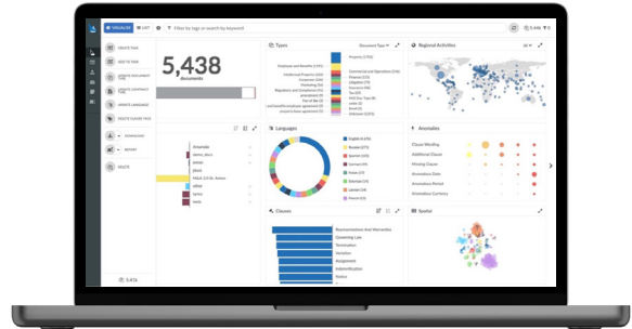
Understand the entire dataset at a glance with Luminance's AI-powered data visualisation

As a language- and jurisdiction-agnostic tool, Luminance's AI is capable of working seamlessly across multilingual document sets. With IDEXX's legal team based across the United States, Europe and Asia, the company is capitalising on Luminance's rapid cloud-based deployment and in-built collaboration tools to ensure the easy allocation of tasks and tracking of work progression across locations.