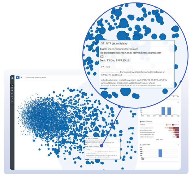
Understand the entire dataset at a glance with Luminance's AI-powered data visualisation

🕒 >50% Time-Savings During document review